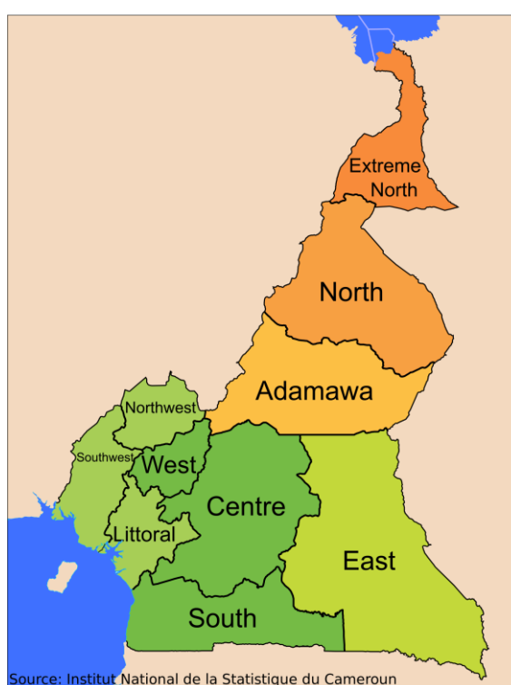
Figure 1: Map of Cameroon

Young people represent more than 50% of the population. It is expected the demand for education will increase. The urban population has grown at an accelerated pace from 14% in 1950 to 58% in 2010. This trend is expected to continue between 2010 and 2020. Figure 1 shows the 10 subdivisions of Cameroon. The population is unequally distributed over the territory. This contributes towards education inequality.